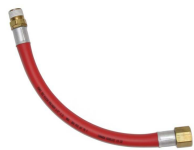
33304 91488205 Hose whip, 1/2" NPT, 13 mm inside diameter, 30 cm (1 ft)