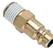
IB8NMC4 88103312 IBN/IBS Series nipple, 1/2" male thread, 8 mm bore (ISO6150B / MIL-C4109)

For the complete range, see our accessory catalogue.