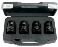
SK8M4L 81287419 1" Impact socket set (4 pcs) (27, 30, 32 and 33 mm)