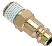
77NMC4 88104096 7N7/7S7 Series nipple, 1/2" male thread, 7.2 mm bore (EURO 7.2 - 7.4)