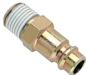
IB11NMC4 25014036 IBN/IBS Series nipple, 1/2" male thread, 11 mm bore (ISO6150B / MIL-C4109)