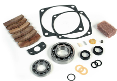
280-TK2 03866605 Motor service kit