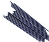
NS11-S22-19 03676343 Stainless steel needles, 127 mm, Ø 3.2 mm (19 pieces)