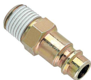
77NMC2 88104070 7N7/7S7 Series nipple, 1/4" male thread, 7.2 mm bore (EURO 7.2 - 7.4)