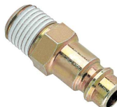
IB6NMC2 88103015 IBN/IBS Series nipple, 1/4" male thread, 6 mm bore (ISO6150B / MIL-C4109)