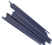
NS11-22-19 03676335 Steel needles, 127 mm (5"), Ø 3.2 mm (19 pieces)