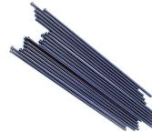
NS11-122-19 03676368 Steel needles, 178 mm (7"), Ø 3.2 mm (19 pieces)