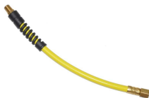
33104 91486330 Hose whip, 1/4" NPT, 6 mm inside diameter, 30 cm (1 ft)