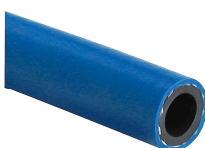
RH-10 92536044 PVC hose, 10 mm inside diameter, 30 m