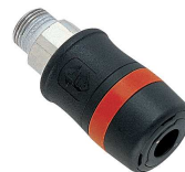
Quick Release Couplings For the complete range, see our accessory catalogue.