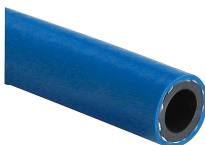
RH-8 92536036 PVC hose, 8 mm inside diameter, 30 m