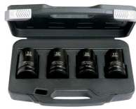
SK8M4L 81287419 1" Impact socket set (4 pcs) (27, 30, 32 and 33 mm)