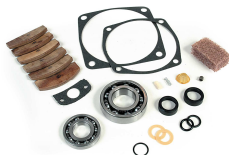
03866613 Motor service kit