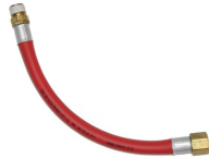
91488205 Hose whip, 1/2" NPT, 13 mm inside diameter, 30 cm (1 ft)