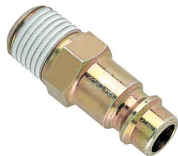
25014036 IBN/IBS Series nipple, 1/2" male thread, 11 mm bore (ISO6150B / MIL-C4109)