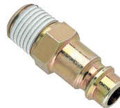
88104096 7N7/7S7 Series nipple, 1/2" male thread, 7.2 mm bore (EURO 7.2 - 7.4)