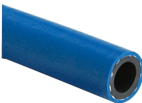
RH-10 92536044 PVC hose, 10 mm inside diameter, 30 m