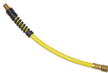
33104 91486330 Hose whip, 1/4" NPT, 6 mm inside diameter, 30 cm (1 ft)