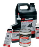
Lubricants For the complete range, see our accessory catalogue.