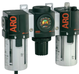
Filters, regulators, lubricators For the complete range, see our accessory catalogue.