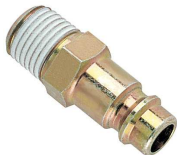
77NMC2 88104070 7N7/7S7 Series nipple, 1/4" male thread, 7.2 mm bore (EURO 7.2 - 7.4)