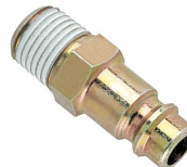
IB6NMC2 88103015 IBN/IBS Series nipple, 1/4" male thread, 6 mm bore (ISO6150B / MIL-C4109)