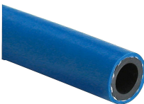
RH-8 92536036 PVC hose, 8 mm inside diameter, 30 m